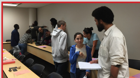
McNair Students interview one another during the Personal Statement Writing Seminar in October 17, 2015.