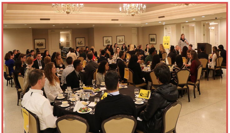
Four McNair students attended the annual Dine Dress Interview event where they received tips regarding etiquette and interview skills.