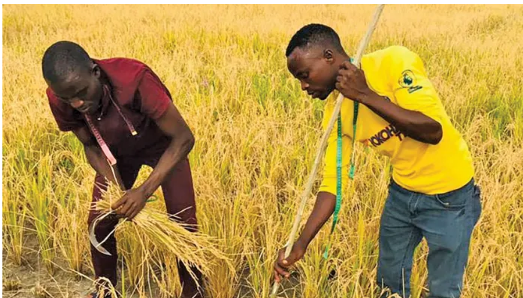
Cutting edge: one team of researchers helped Tanzanian farmers manage financial risk

It is difficult to define, challenging to achieve and hard to quantify, but the FT’s Responsible Business Education Awards show that a positive social impact can be made by business school academics, through their research. Not only does their work tackle significant societal problems, but their findings are driving change in policy or practice.