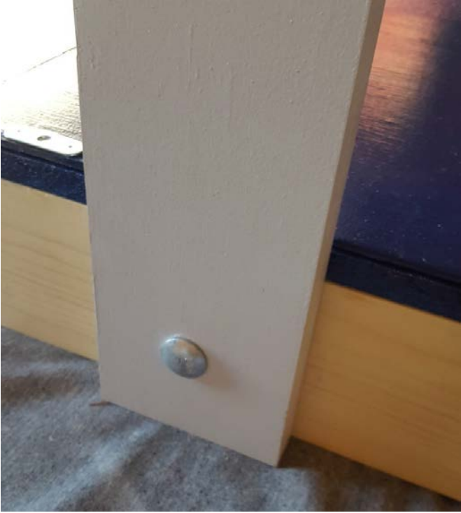
Figure 3 - Carriage Bolt