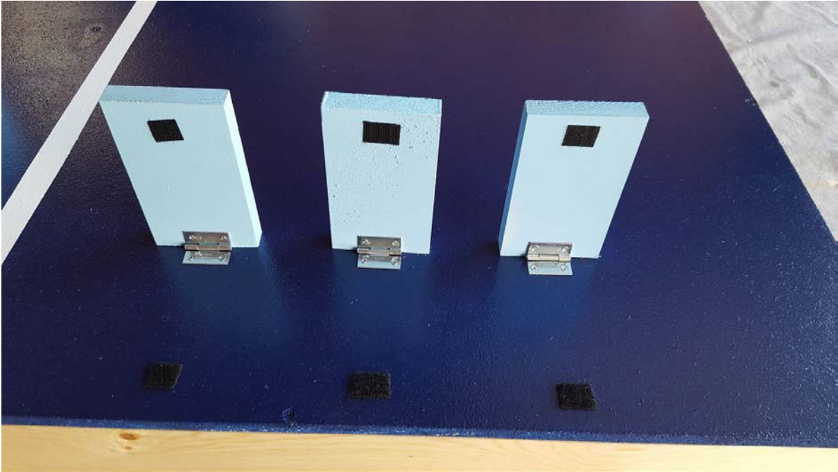
Figure 2 - Velcro attached to the back of the pirate ships.