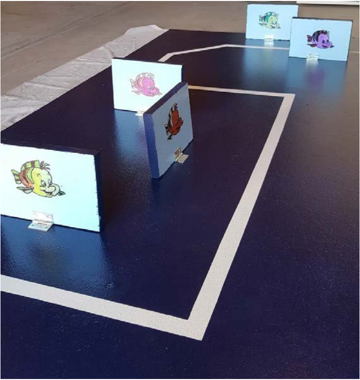
Figure 4 - Position of walls