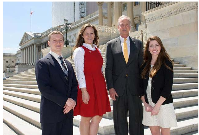
Interns with Senator Jerry Moran