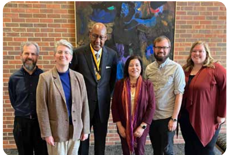
Department members with Judge Sturns

The department is proud to celebrate Judge Louis E. Sturns , who was inducted into the Fairmount College of Liberal Arts and Sciences Hall of Fame in February 2023. Honorees are chosen because they exemplify the merits and advantages of a liberal arts and sciences education. Louis E. Sturns is a 1971 alumnus with a bachelor’s degree in political science. He has served as the first African American Criminal District Court Judge in Tarrant County, Texas; the first African American on the Texas Court of Criminal Appeals, the state’s highest court for criminal cases; and the first African American president of the Tarrant County Bar Association.