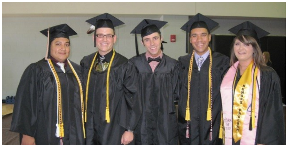
* Cum Laude ** Magna Cum Laude *** Summa Cum Laude