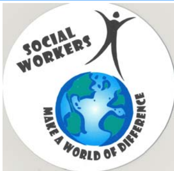
Actual Size = 3" diameter

SWOGS (Social Work Organizations of Graduate Students) is selling magnets!