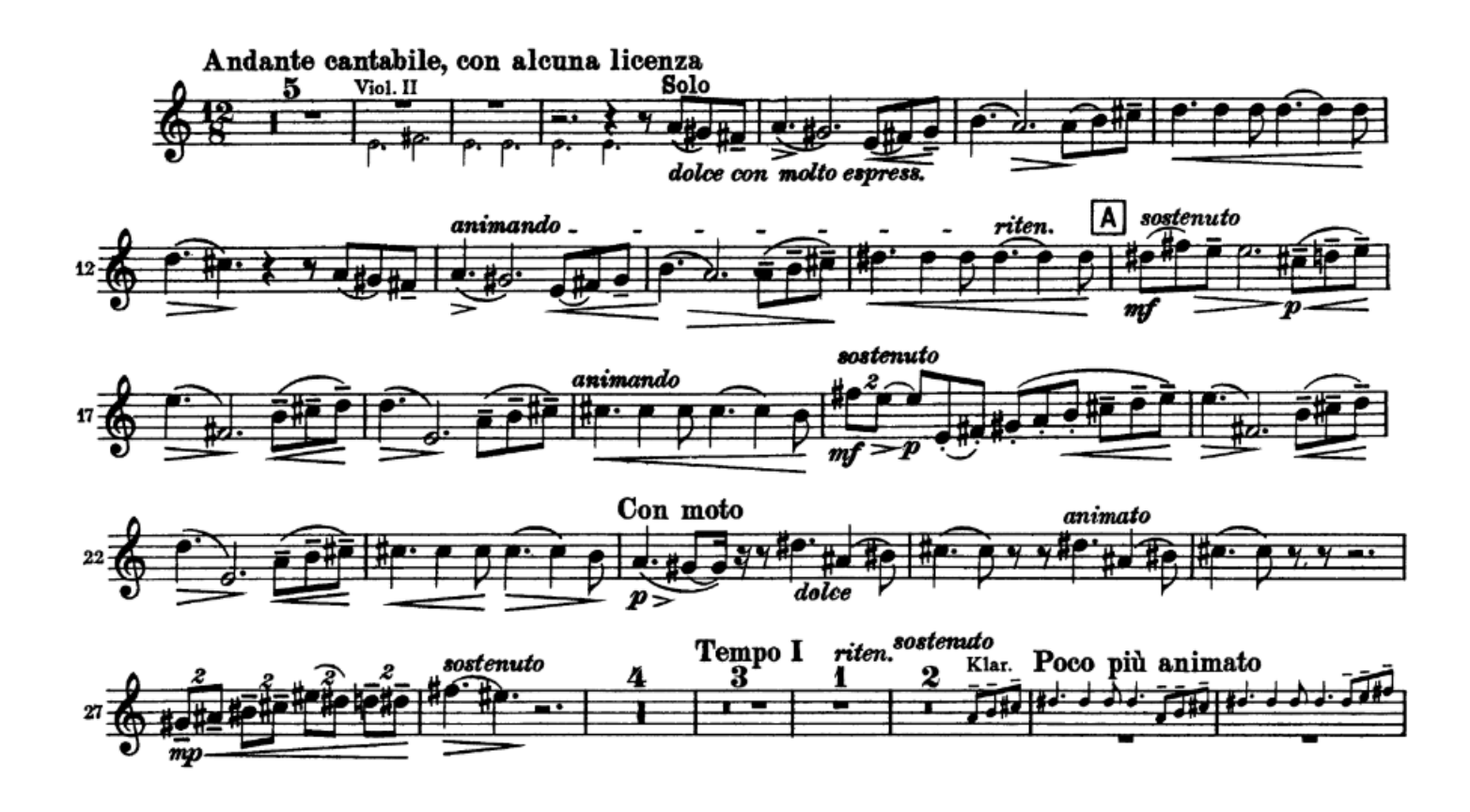
06 | Mahler | Symphony No. 3 mvt. 1