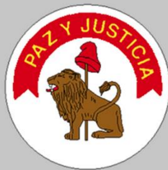
detail of reverse