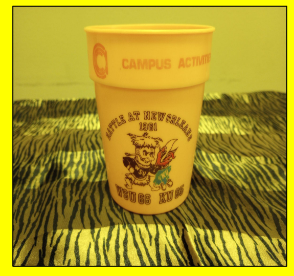
Battle at New Orleans, 1981 WSU 66, KU 65