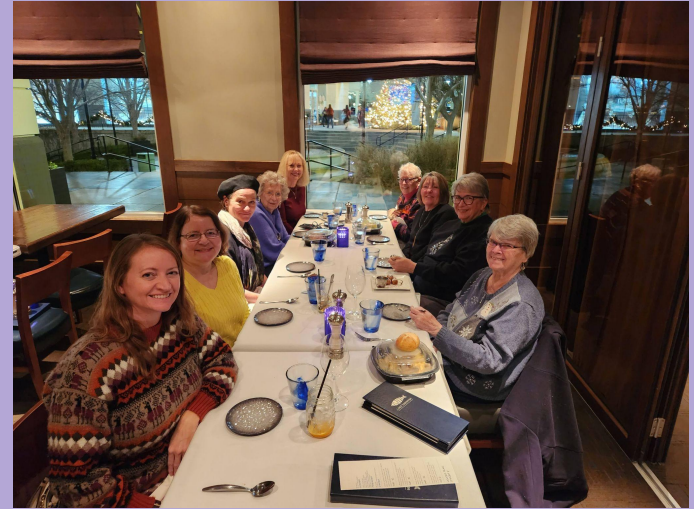
Friends and Food 2022 holiday dinner at Newport Grill.

Our next dinner is Sunday, October 29 at Redrock Canyon Grill. Join the group and email list to receive reminders and to RSVP. November and December are combined into one special holiday dinner at Newport Grille, then we will resume our normal schedule in January.