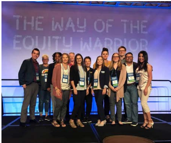
Team photo, San Francisco GEAR UP Annual Conference, July 2019

"Fall has brought on tremendous change for Haysville GEAR UP and both Haysville middle schools as the GEAR UP program becomes fully integrated into everyday school life. I've excitedly anticipated this season of change as it is the beginning of after-school programs, homework assistance, weekend fun, college trips and of course, GEAR UP Week. This fall is just a taste of what GEAR UP students can look forward to for the next several years and I AM HERE FOR IT!"