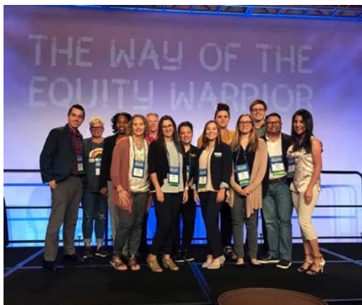
Team photo, San Francisco GEAR UP Annual Conference, July 2019