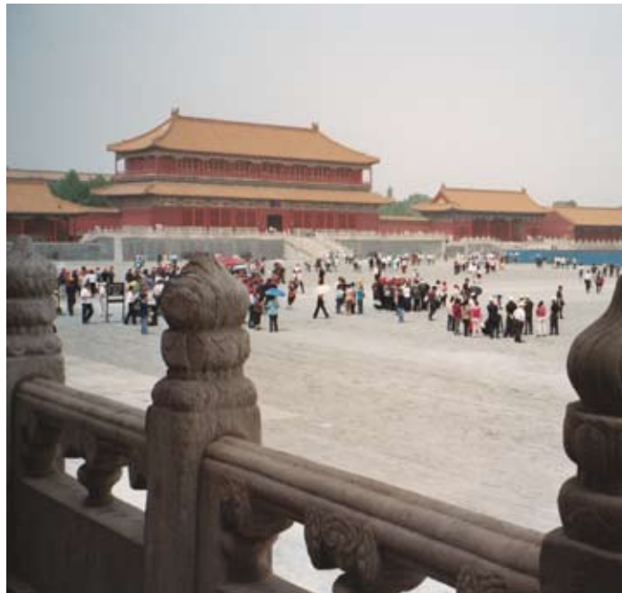
Forbidden City, Beijing, China