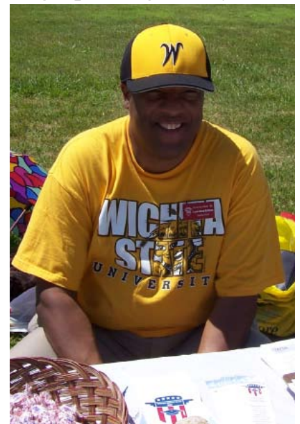
Lawrence Britton VUB's display table at the VA's Block Party Event during the River Festival May 2008

Veterans Upward Bound is here to support you in reaching your goals. We should, “Never measure the height of a mountain until you have reached the top. Then you will see how low it was.” Dag Hammarskjold