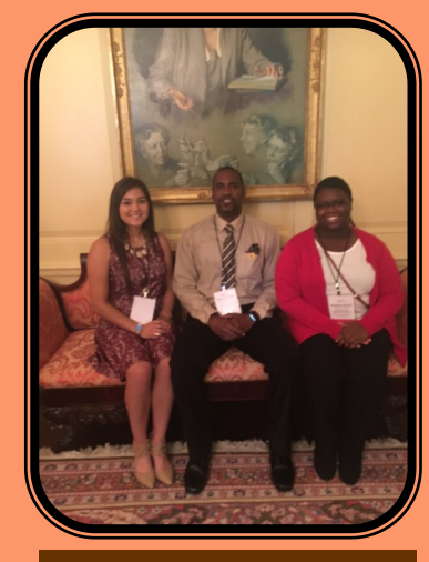
First Lady Summit