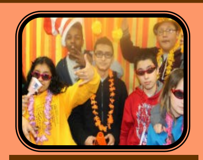
National TRIO Day