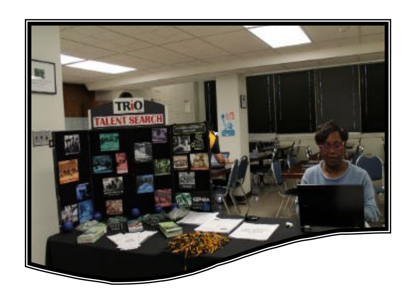
FAFSA Finish Line