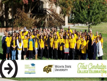
EOC staff pose with other TRIO professionals, faculty, staff & students at the WSU 2018 celebration

The concept of "first-generation" students was introduced into federal policy by the TRIO community in 1980 , during passage of the Higher Education Amendments to the Higher Education Act of 1965. Last November, the Council for Opportunity in Education's Board asked college access and success professionals to join with TRIO across the country for the Annual First-Generation College Celebration on November 8th the Anniversary of the Higher Education Act.