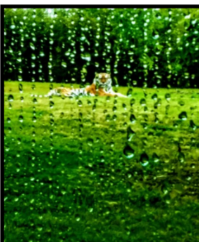
Raindrops and A Tiger